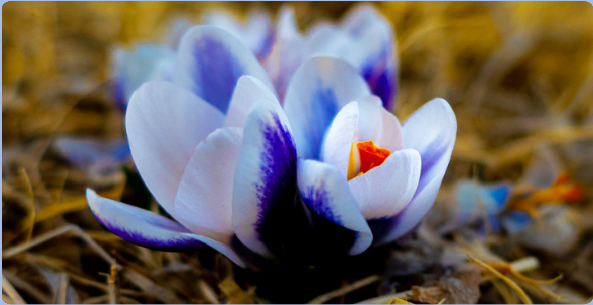
Crocuses brought early spring color to the still-brown demonstration plots of warm season grasses in the Montrose Botanic Gardens.

THE NEWSLETTER OF THE MONTROSE BOTANICAL SOCIETY