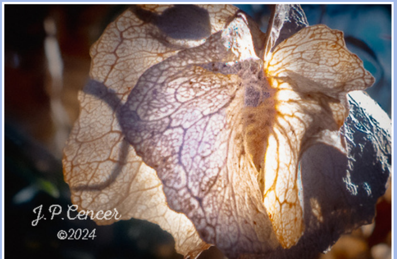
Beautifully backlit, the fruit of the four-wing saltbush.

Venturing out to the Botanic Gardens for the first time since last Fall? Be prepared for the major detour on Niagara Road as the city works on the new roundabout. From South Townsend, you'll need to loop around on Oak Grove Road then Pavilion Drive. Construction is slated to be done by June.