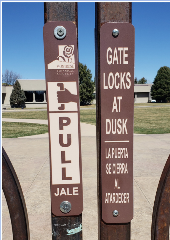
New bilingual signs on the Gardens' front gate to go along with the new magnetic locks.